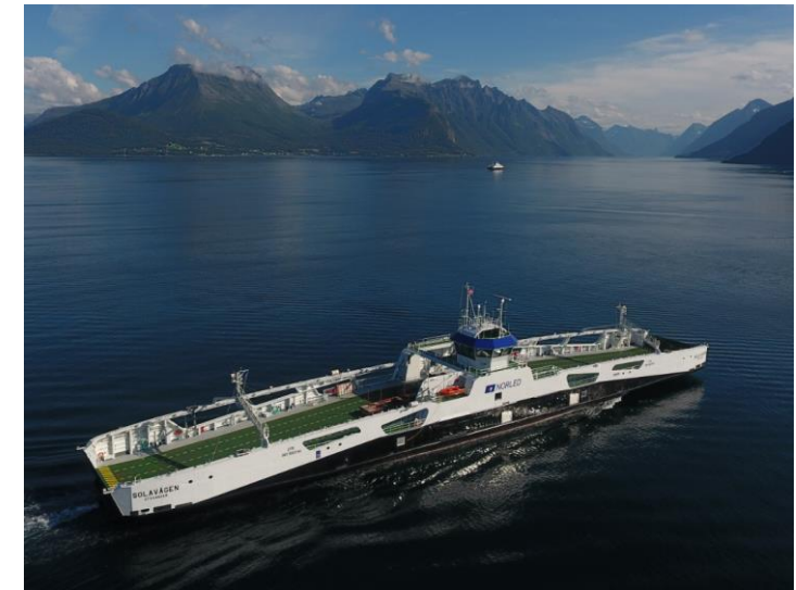
MF Solavågen. Delivered Q3-20