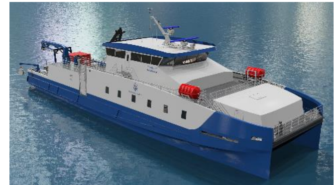
Illustration of new vessel for Directorate of Fisheries